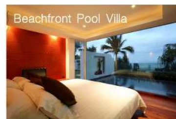
Beachfront Pool Villa

The two beds villa is ideal for friends traveling together or for families. It provides 159 sq. meters of living space and a generous dining area adjacent to the swimming pool. The bathroom has a separate walk in shower and bathtub, complete with full amenities.