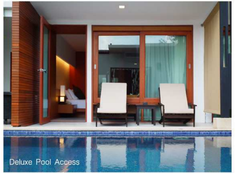
Deluxe Pool Access

Just steps away to the beach from your private accommodation, the Beachfront Pool Villas provide a generous 87 sq. meters of living space, a private swimming pool on the beach and a separate furnished living room with a home theatre and DVD player.