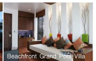
Beachfront Grand Pool Villa