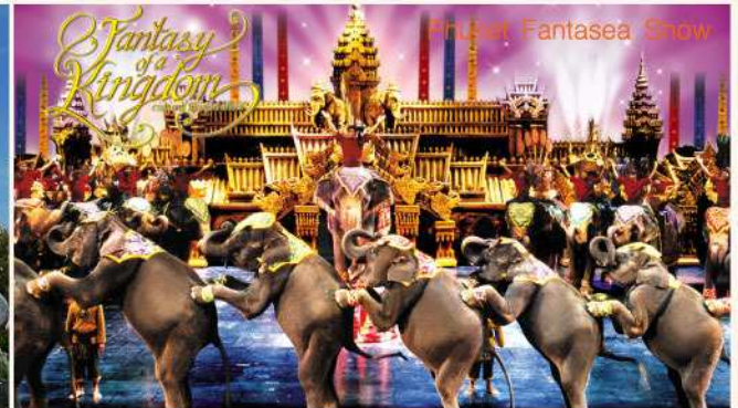
Phuket Fantasea Show