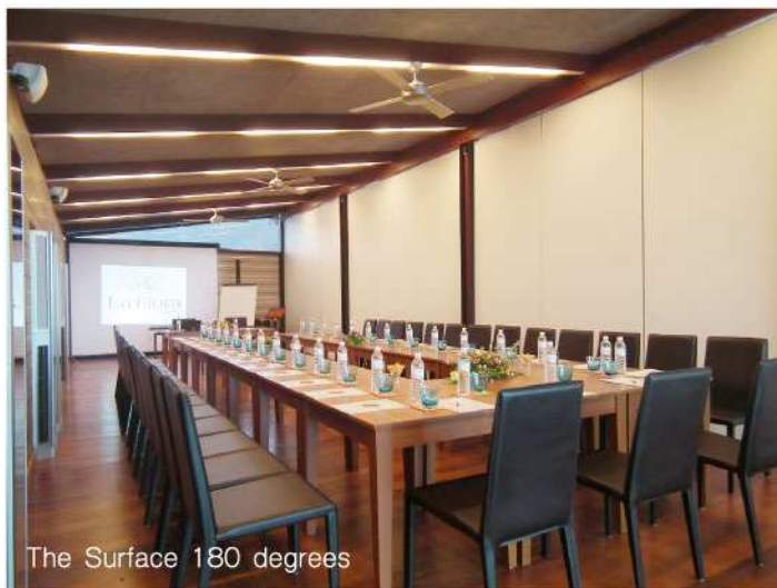
The Surface 180 degrees

Bangla Road is famous for its raunchy nightlife – awakening when the sun sets. Bangla becomes the liveliest party spot – be ready for action!