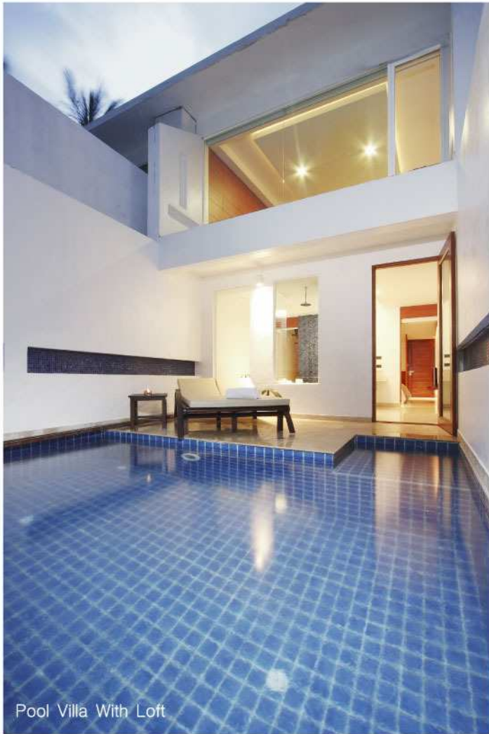
Pool Villa With Loft