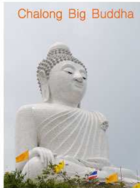
Chalong Big Buddha