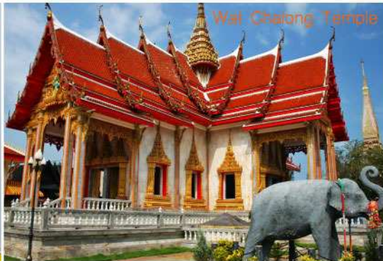
Wat Chalong Temple